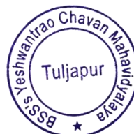
Principal Yeshwantrao Chavan Mahavidyalaya, Tuljapur, Dist. Osmanabad.