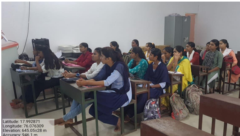
Students communicated with the resource person