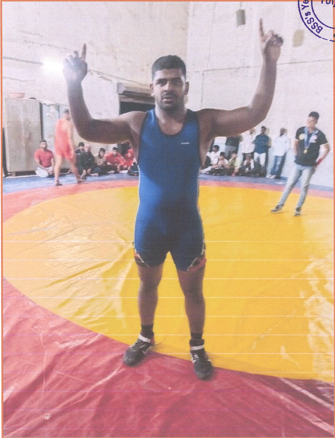
Inter College Wrestling Tournament 97 Kg. Free Style First AIU Wrestling Participated

Co-Ordinator ICAC Yeshwantrao Chavan Mahavidyalaya, Tuljapur,