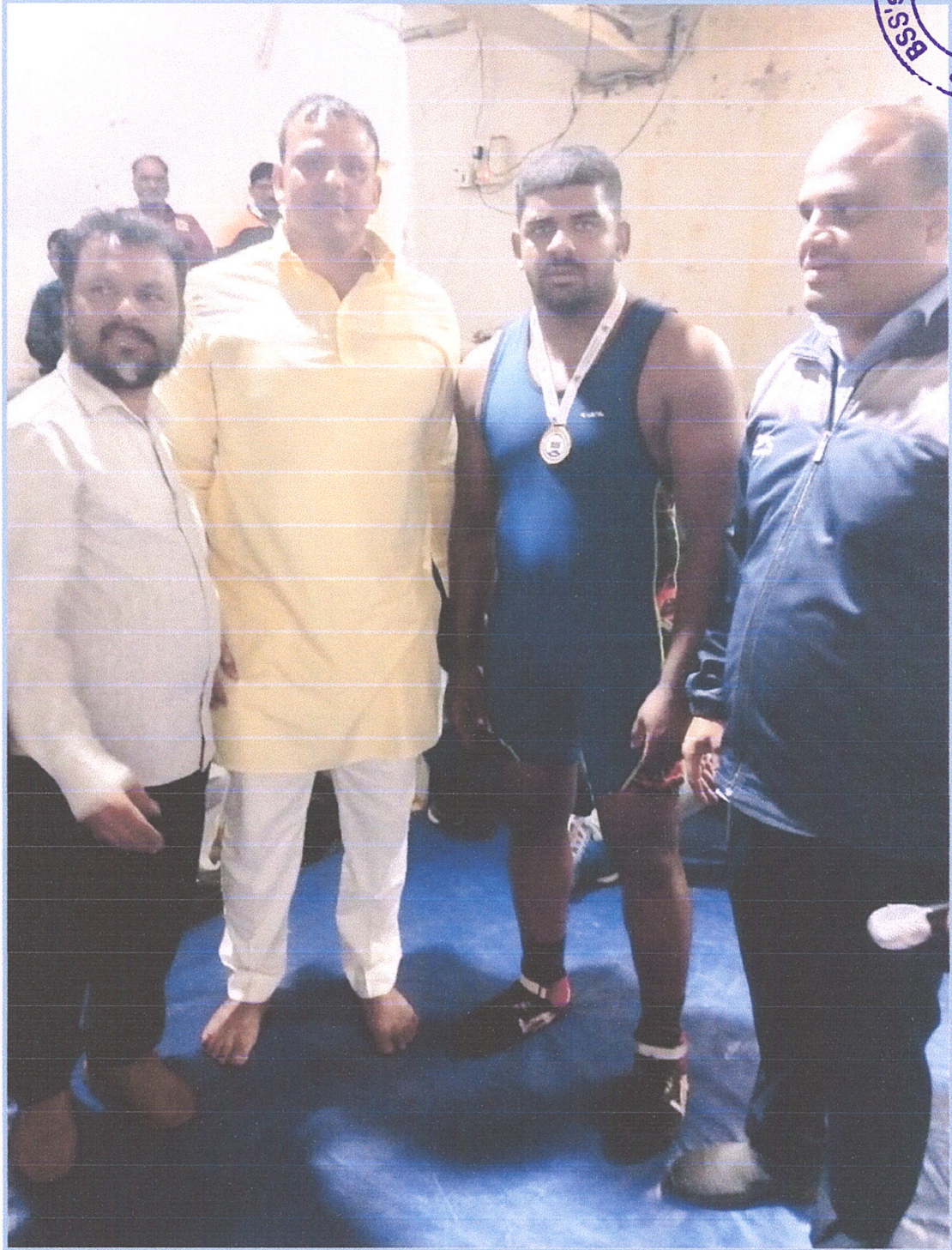
Inter College Wrestling Tournament 97 Kg. Free Style First AIU Wrestling Participated